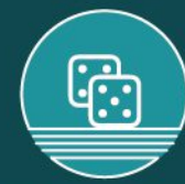
INDOOR GAME ZONE