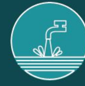
24/7 WATER SUPPLY