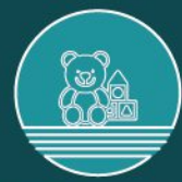
TODDLER PLAY AREA