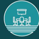
MULTI PURPOSE ROOM