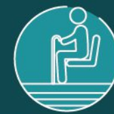
SENIOR CITIZEN SEATING